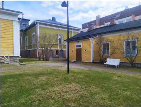
Old Kuopio Museum