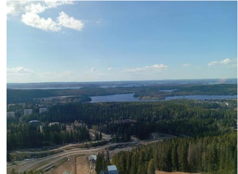
View from Puijo Tower